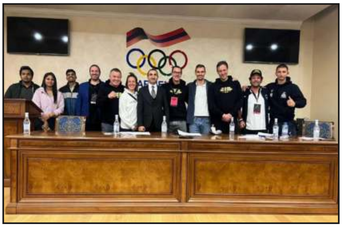
Team WCBO with Indian representative in Armenia Olympic Committee Office.