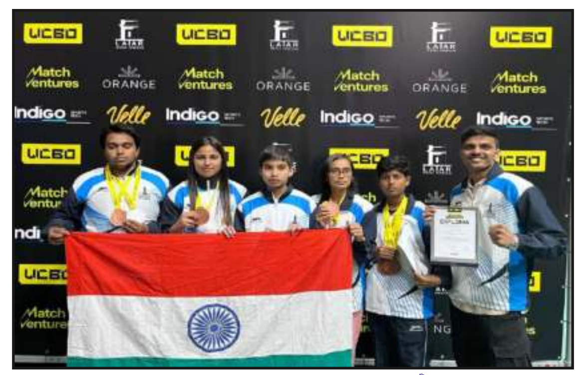
Team India clinched 1 Gold, 1 Silver & 5 Bronze Medals at the 6<sup>th</sup> World Chessboxing Championship 2024.