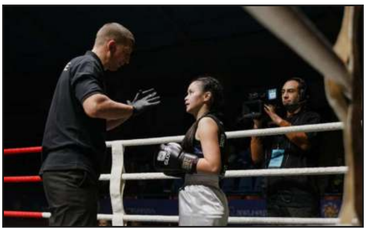
World Chessboxers in Action.