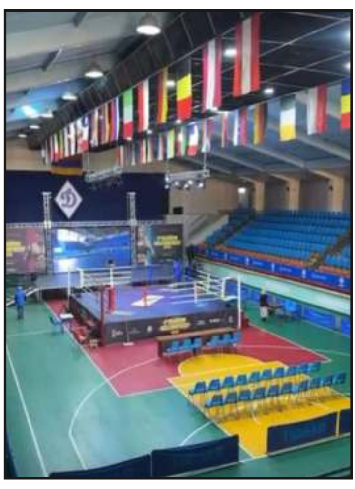
Venue of 6<sup>th</sup> World Chessboxing Championship 2024